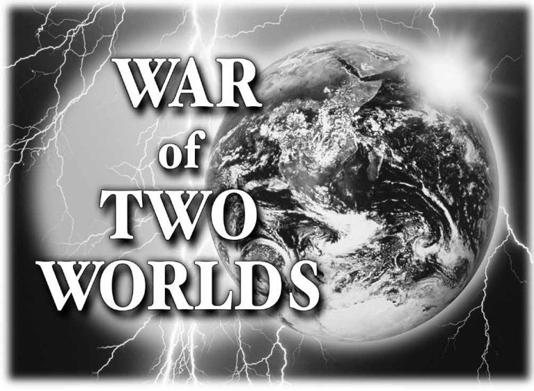
"The kingdoms of this world are become the kingdom of our Lord, and of His Christ; and He shall reign forever and ever . . . And the nations were angry . . . " — Revelation 11:15, 18

clash between the kingdoms of this world, with Satan as their ruler, and the kingdom of God, with Christ as His appointed reigning King. These two worlds are at war, and there will never be peace as long as Satan and his followers are permitted to influence and test mankind. Soon the prince of peace, Jehovah's right arm, will take full control, and Satan will be bound. (Revelation 20:1-3) But, at this end time of the present evil world, Christ starts to take control of the affairs of earth and is tearing down this old order—the financial, social, civil and religious powers which have been corrupted by evil.