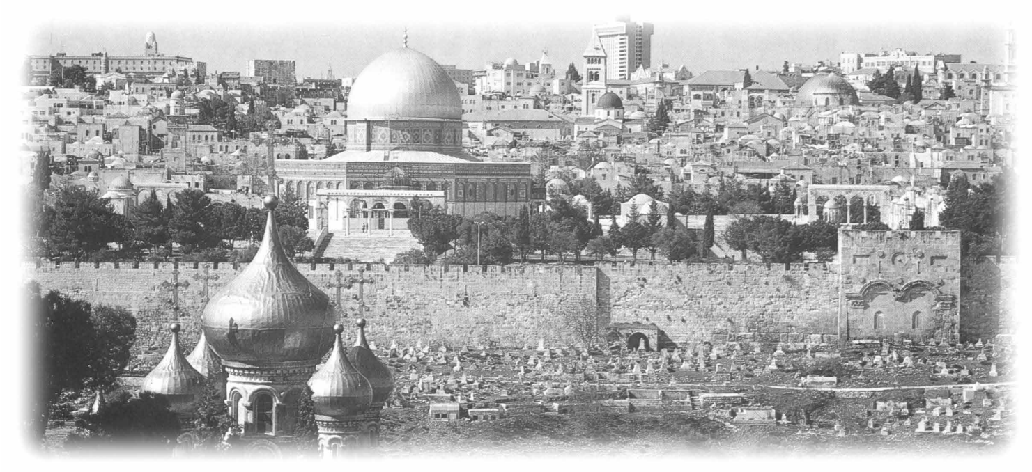
"Pray for the peace of Jerusalem: they shall prosper that love thee." — Psalm 122:6

In the continuing battle for Jerusalem, Israel occupies a precarious position. Her enemies are numerous and her friends are deserting her. This struggle for Jerusalem is not primarily political but religious, as Arabs, Jews—even some Christians—claim a God-given right to Jerusalem as their capital.