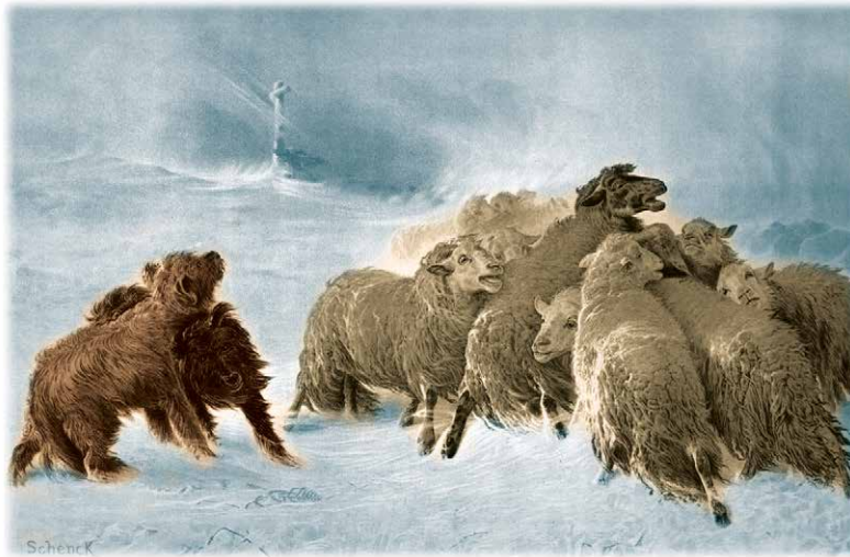
“Fear not little flock, for it is your Father’s good pleasure to give you the kingdom.” — Luke 12:32

Most Christians today would agree that these are the last days , and therefore, this is the final, Laodicean stage of the Church. According to